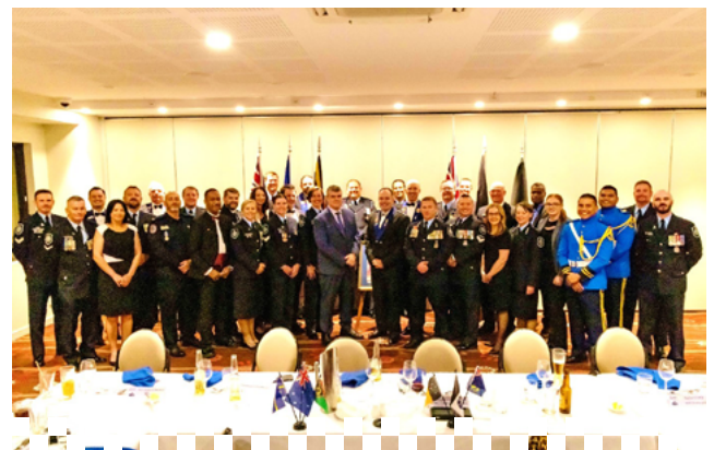
DI/CAPO Course participants

Thank you to all involved in raising funds for AFP Legacy. We are most grateful.