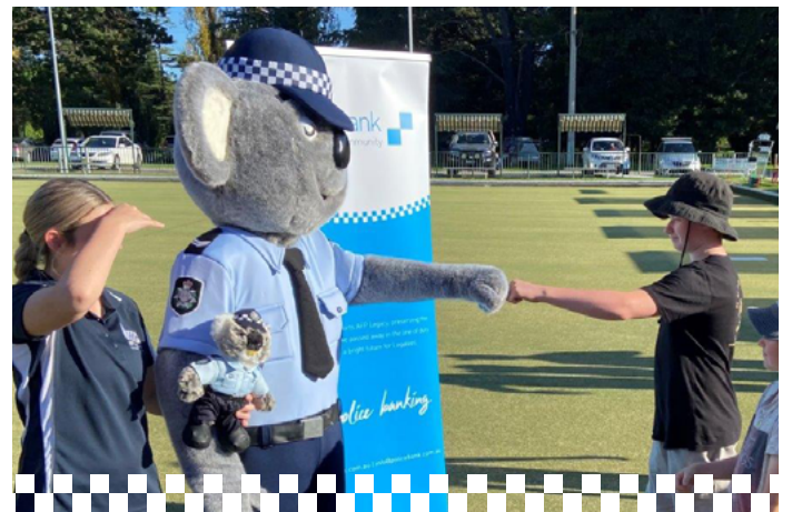
Kenny Koala greeting our Legatee's at Family Day

Thank you to all who continue to support AFP Legacy via salary deductions each fortnight. Without your continued support we cannot hold these types of events. Gatherings such as our Family Day allow Legatees, who have lost a loved one, to come together, make new friends and share experiences. The events also remind our families that they are not alone in their grief and that AFP Legacy is here to offer welfare and support services for each Legatee.