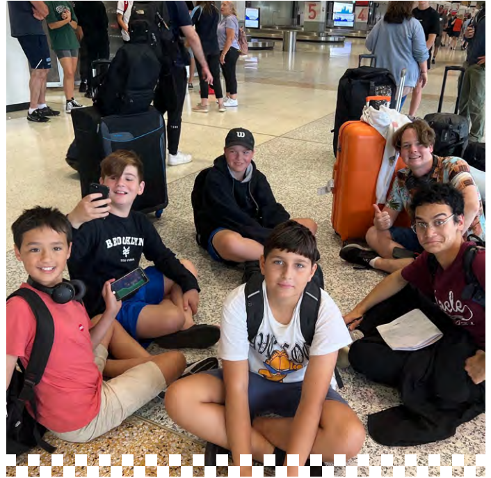
Legatees eagerly awaiting their flight