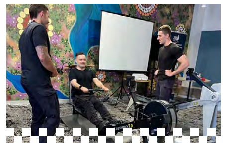
The Moe & Row Team in action