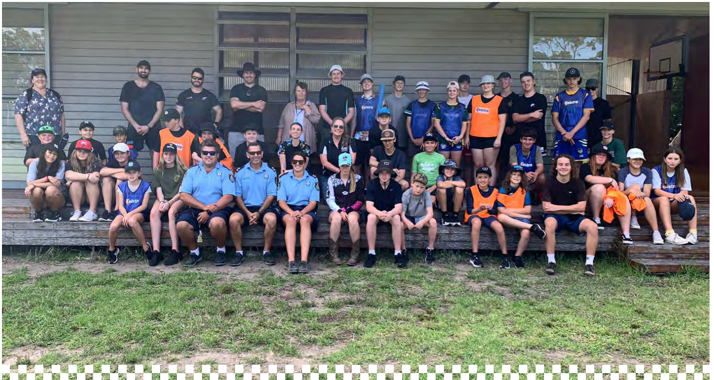
NSW Police Legacy & AFP Legacy Legatees and Camp Supervisors

If you're a kid whose old enough to attend these camps, I can't recommend them enough. It is the greatest way to meet and bond with your family here at Police Legacy. The only thing I regret from the camp was not joining them sooner. One of the things that I loved about the camp personally, was that as a 17-year-old who graduated high school, rapidly approaching his adulthood, I was able to have an experience that you can only have as a kid with some amazing people one last time before I was hit with the ickiness of being an adult. Despite not being able to come back to the youth camp, Police Legacy run 18-25yr young adult camps that I will for sure be attending. I'll miss the incredible times I had on that camp, but I hope I see you all again soon!